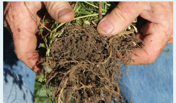
example of healthy roots

Nonpoint source pollution generally results from land runoff, precipitation, atmospheric deposition, drainage, seepage or hydrologic modification. Nonpoint source (NPS) pollution, unlike pollution from industrial and sewage treatment plants, comes from many diffuse sources. NPS pollution is caused by rainfall or snowmelt moving over and through the ground. As the runoff moves, it picks up and carries away natural and human-made pollutants, finally depositing them into lakes, rivers, wetlands, coastal waters and ground waters.